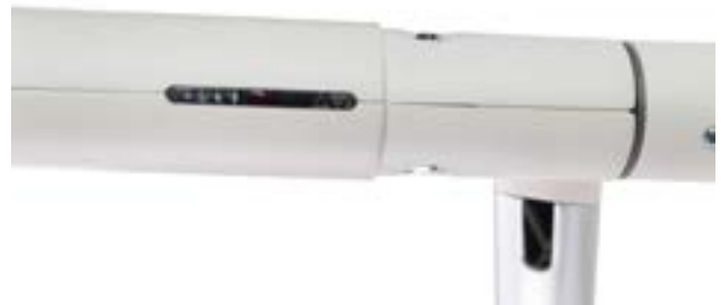
Illustrated: Cable management system