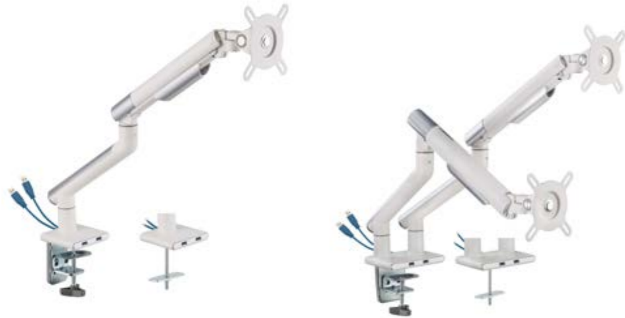
Illustrated: Mars Single Arm