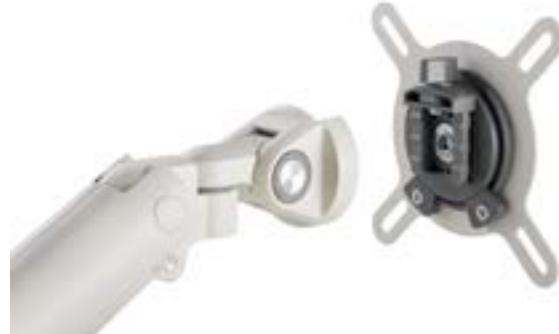
Illustrated: Spring tension mechanism adjustment